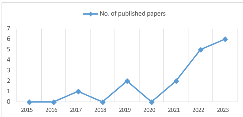
Figure 1. Publication Trend From 2015 to 2023

To answer research question 1, the collected data were examined in terms of publication trend. The number of collected articles ( No = 16 ) signified the novelty of the topic and how it has attracted researchers' attention more after the pandemic. That is, 13 out of 16 papers belonged to the period 2021- 2023, and the rest of the papers ( N = 3 ) to years 2017 and 2019, with no studies reported before 2017. Figure 1 portrays the growing trends of publications after 2020.